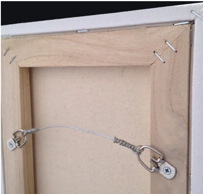
Fig. 4 - D-hooks facing inward with plastic coated wire. Wire is fastened with a cow hitch and the ends are wrapped. Please remember to tape the wire ends.