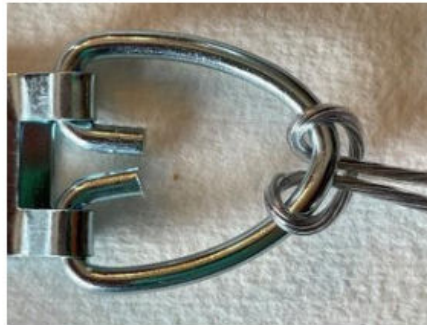
Fig. 2- Slip knot with ends wrapped.